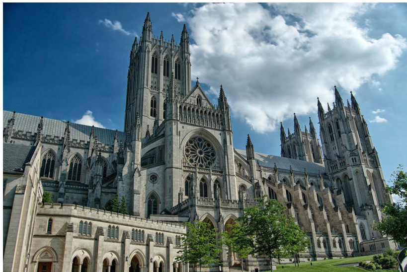
Washington National Cathedral